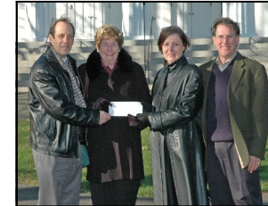
Madison Community Services