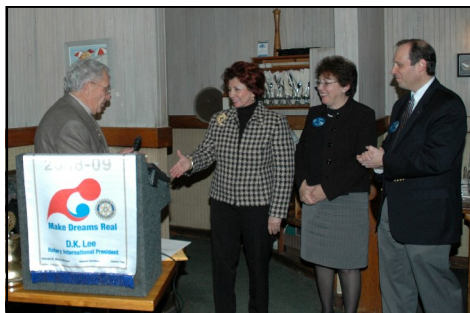
New Member Induction

Following approval by the Board of Directors, your nomination for membership will be announced to the Club. You will take the final step to become a member by participating in a formal induction ceremony.