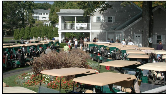
Annual Golf Classic