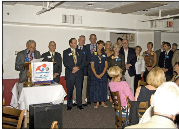
Installation of Officers