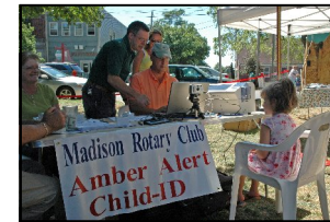
Amber Alert Registrations