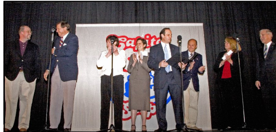
Annual "Capitol Steps" Theatre Event